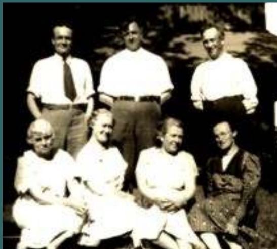
Summer 1934—L to R: